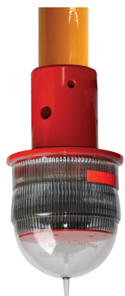
Sectored Bridge Light

Large 10watt solar module & 7.5Ah battery